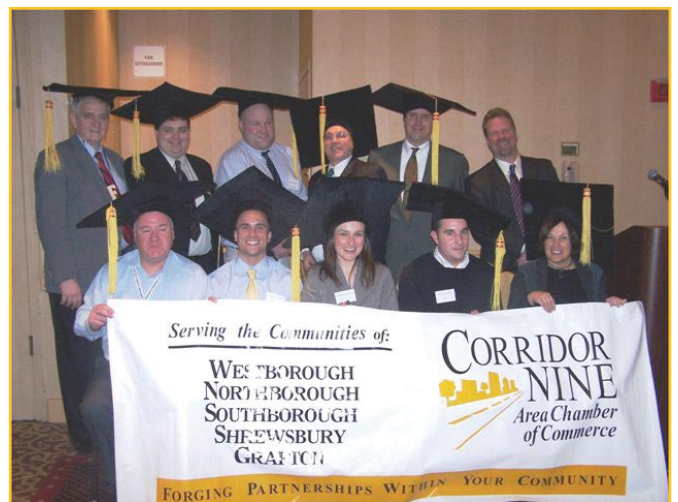
Corridor Nine Geniuses: Winners of the "Are you Smarter than a 5th Grader?" challenge at the Ultimate Networking Breakfast on February 26, 2009