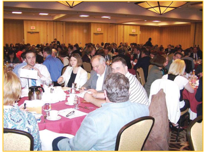
April Speed Networking Breakfast with 240 Members