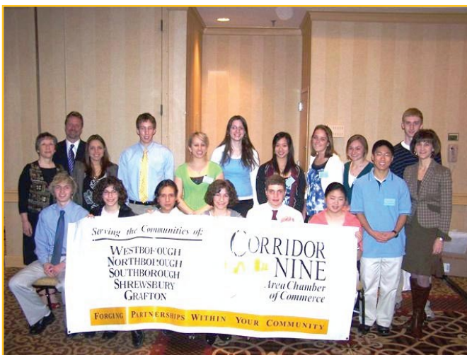
2009 Scholastic Award Recipients